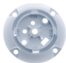
Flush Mount Plate 3000-202