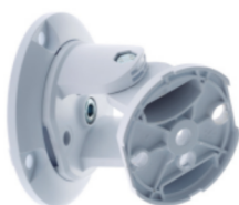
Adjustment Bracket 3000-201